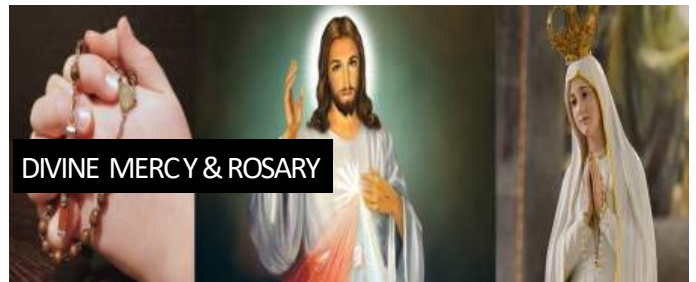
DIVINE MERCY & ROSARY

If you have a family member serving in the Armed Forces and would like them to be remembered in our Parish prayers, please call the Parish Office and leave their names, rank and branch of service.