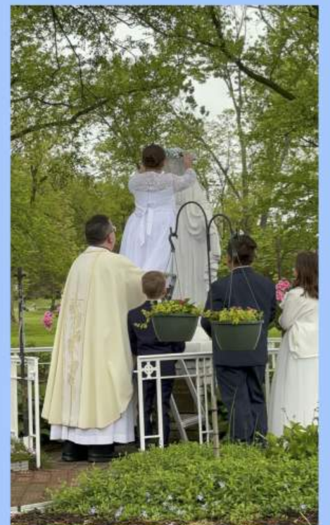
The gift of Our Blessed Mother Mary

Wow, do we have sooooo much to be thankful for. . .