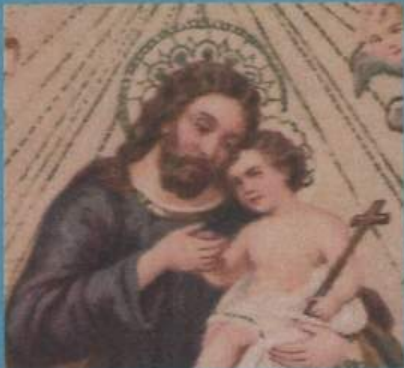
Good Saint Joseph, pray for us!

Temperance: Enjoying things in a proper, balanced way