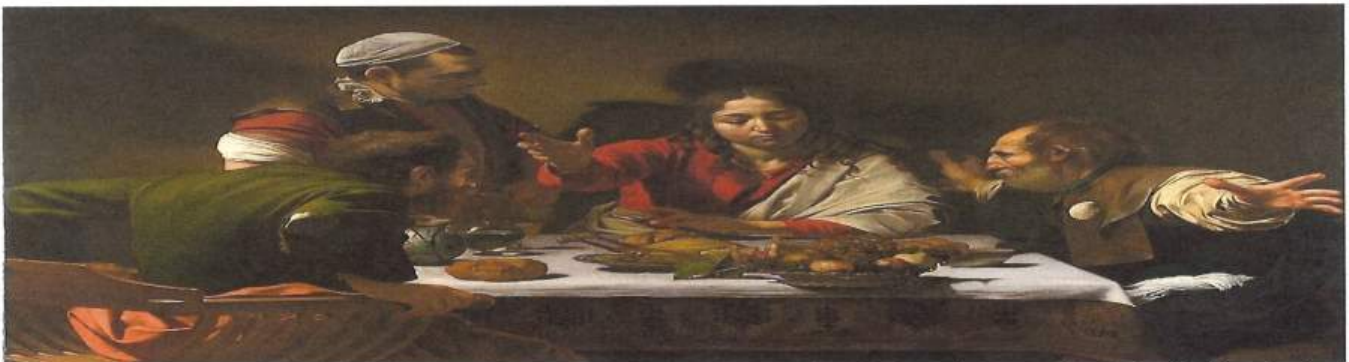
Supper at Emmaus by Michelangelo Caravaggio – National Gallery, London