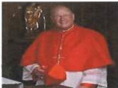
Cardinal Timothy Dolan Archbishop of New York, Author

Man Up Philly 2023 invites the men of the Archdiocese Of Philadelphia to the 15 th Annual Men's Spirituality Conference to be held IN PERSON on Saturday, March 4 th at Cardinal O'Hara High School .